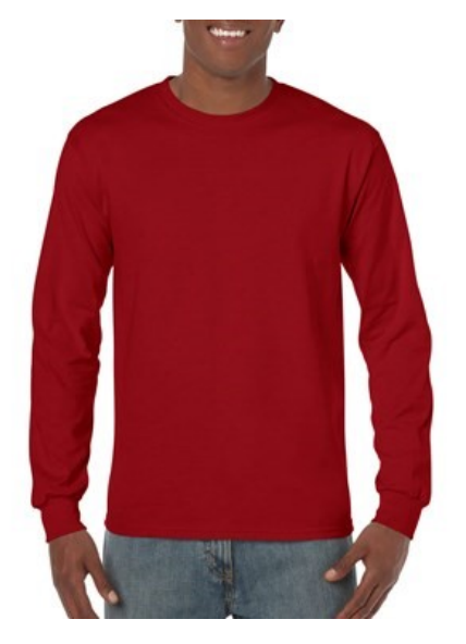
Cardinal Red Available sizes small - 3x