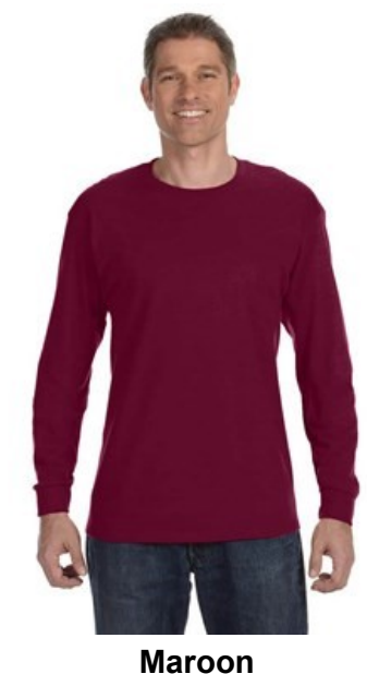
Available sizes small - 3x