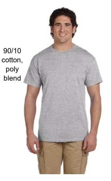
Sport Grey (heathered) Available sizes: small - 5x