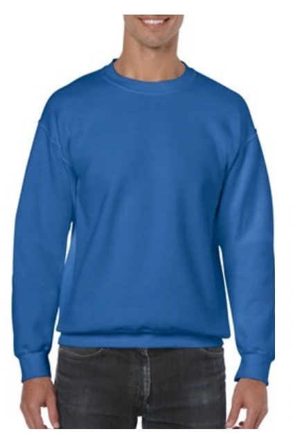
Royal (blue) Available sizes: Small- 5x