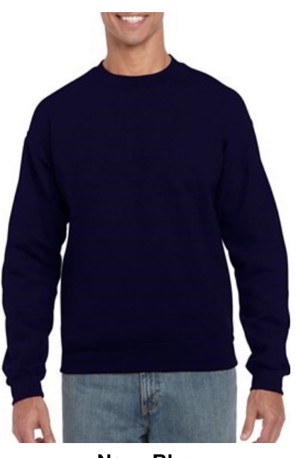
Navy Blue Available sizes: Small- 5x