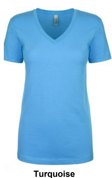
Available sizes: xtra small - 3x