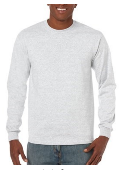
Ash Grey Available sizes: small - 3x