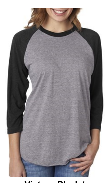
Vintage Black / Heather Grey Available sizes: xtra small - 3x