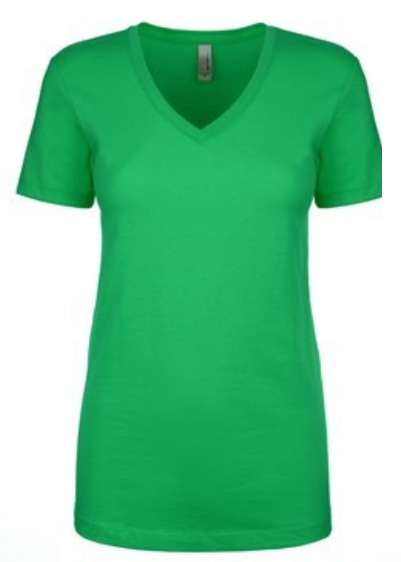
Kelly Green Available sizes: xtra small - 3x