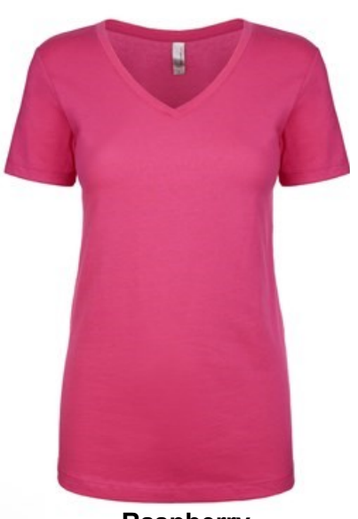
Raspberry Available sizes: xtra small - 3x