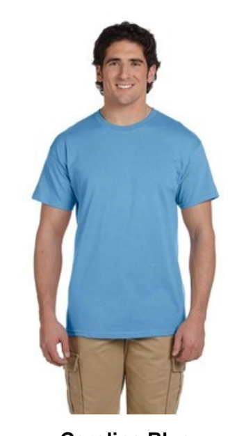
Carolina Blue Available sizes: small - 5x