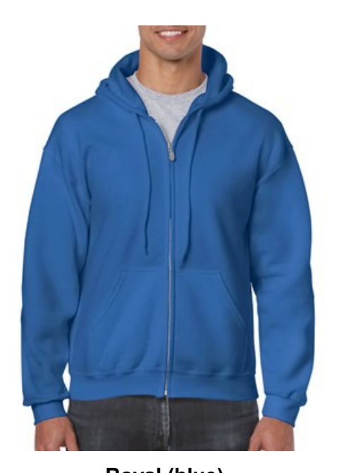
Royal (blue) Available sizes: small - 5x