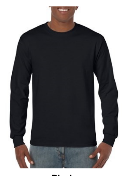
Black Available sizes: small - 3x