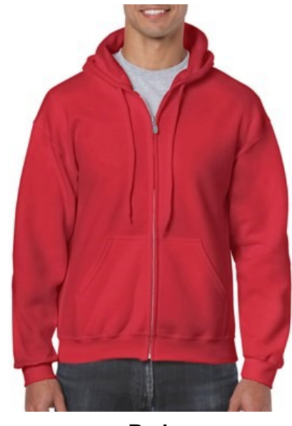
Red Available sizes: small - 5x