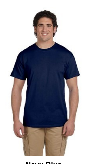
Navy Blue Available sizes: mall - 5x