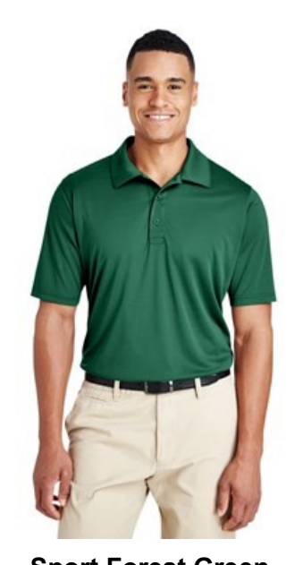
Sport Forest Green Available sizes: xtra small - 6x