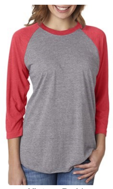
Vintage Red / Heather Grey Available sizes: xtra small - 3x