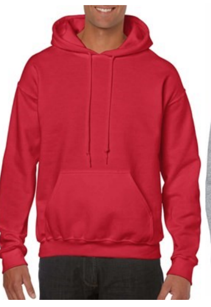
Red Available sizes: small - 5x