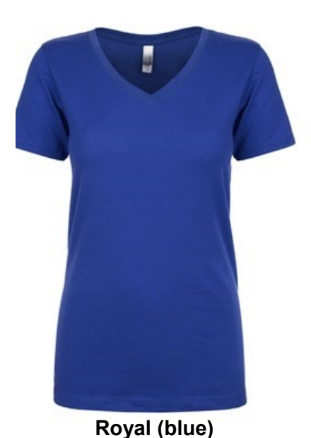
Available sizes: xtra small - 3x