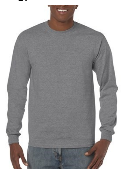
Graphite Heather Available sizes: small - 3x