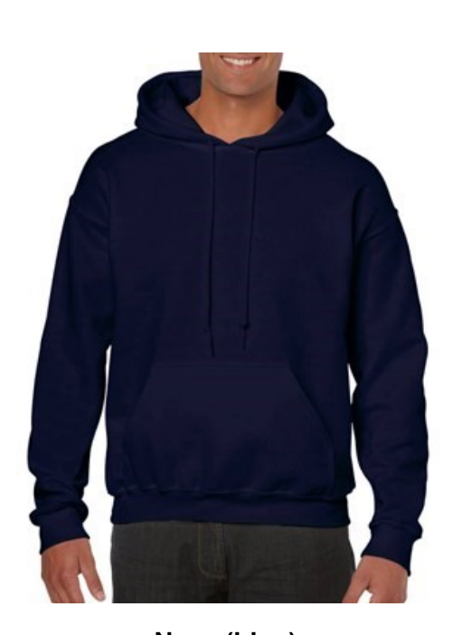
Navy (blue) Available sizes: small - 5x