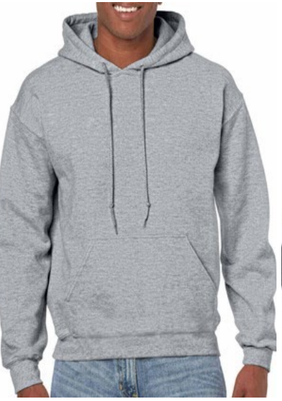
Sport Grey Available sizes: small - 5x