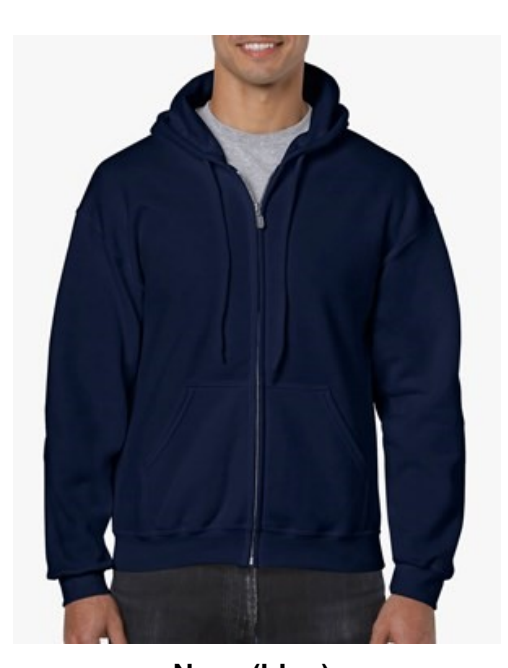
Navy (blue) Available sizes: small - 5x