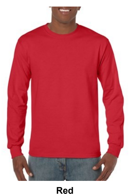
Available sizes small - 3x