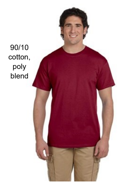
Antique Cherry Red (heathered) Available sizes small - 5x (4x currently unavailable)