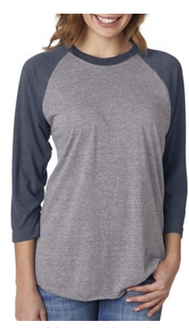
Vintage Navy / Heather Grey Available sizes: xtra small - 3x