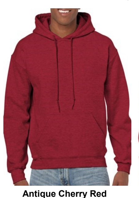
(heathered) Available sizes: small - 4x (no 3x)