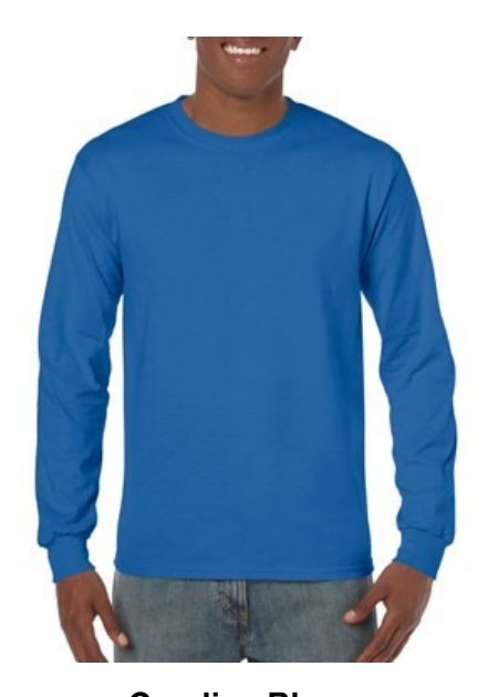
Carolina Blue Available sizes: small- 3x