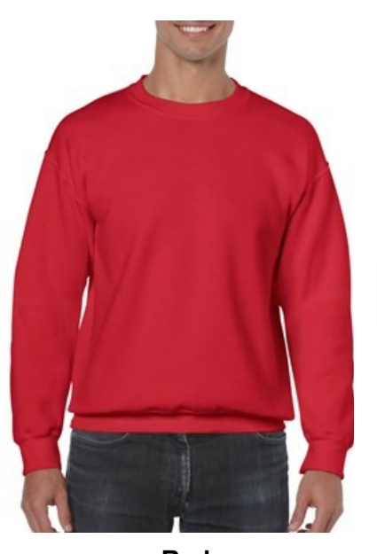
Red Available sizes: small - 5x