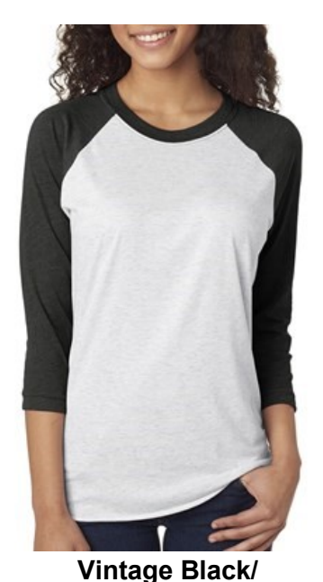
Heather White Available sizes: xtra small - 3x