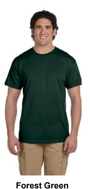
Available sizes small - 5X