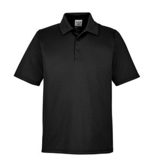
Black Available sizes: xtra small - 6x