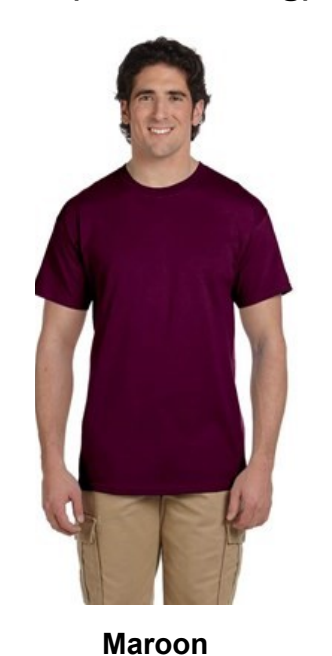
Available sizes small - 5x