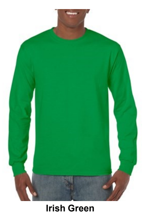
Available sizes small - 3x