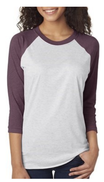
Vintage Purple / Heather White