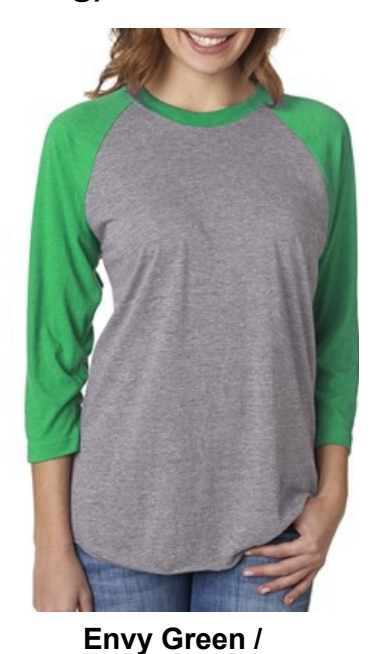
Heather Grey Available sizes: xtra small - 3x