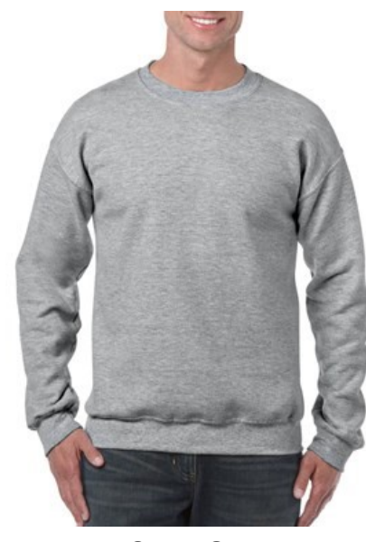
Sport Grey Available sizes: small - 5x