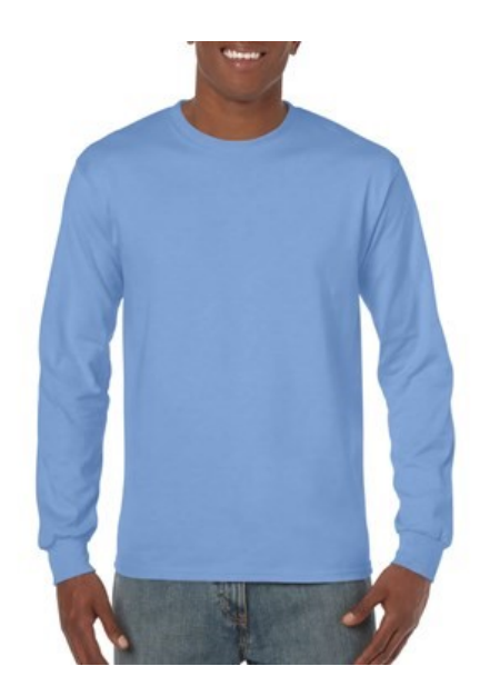
Carolina Blue Available sizes: small- 3x