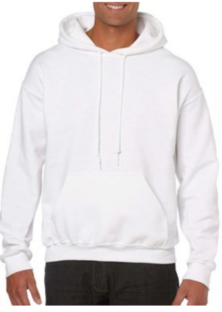
White Available sizes: small - 5x