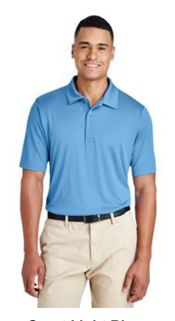
Sport Light Blue Available sizes: xtra small - 6x