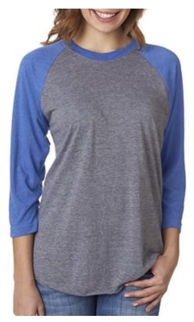
Vintage Royal (blue) / Heather Grey Available sizes: xtra small - 3x