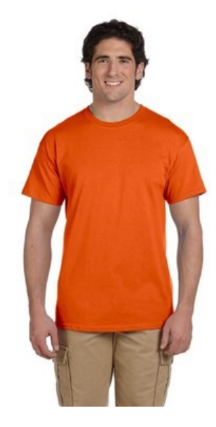
Orange Available sizes: small - 4x (no 5x)