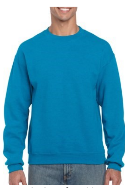
Antique Sapphire (heathered) Available sizes: Med - 5x