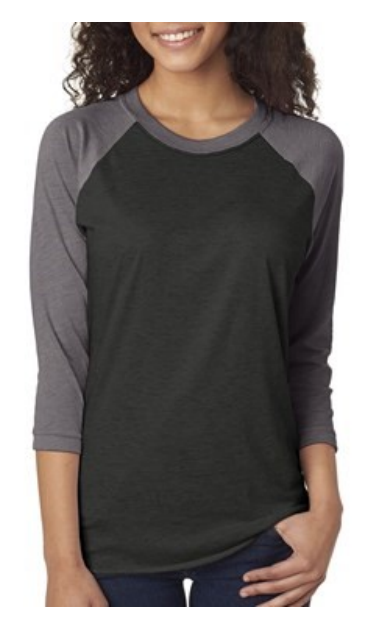
Heather Grey / Vintage Black Available sizes: xtra small - 3x