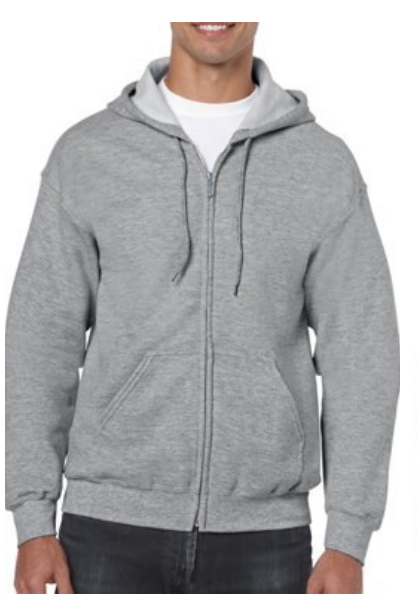
Sport Grey Available sizes: small - 5x