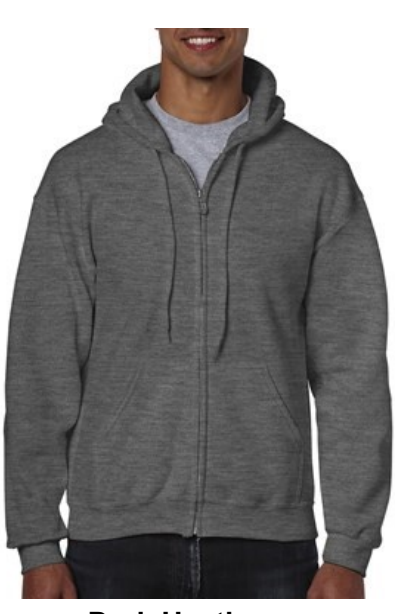
Dark Heather Available sizes: small - 5x