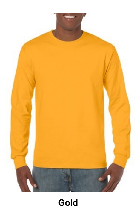
Available sizes small - 3x