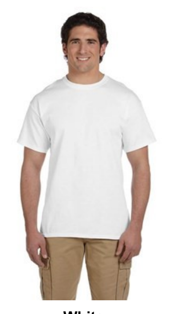
White Available sizes: small - 5x