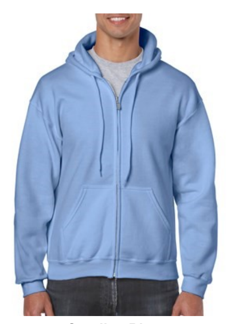
Carolina Blue Available sizes: small - 5x (no 4x)