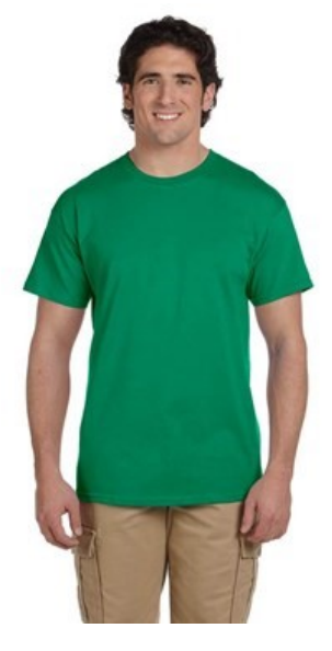
Kelly Green Available sizes s - 3x (4x, 5x unavailable)