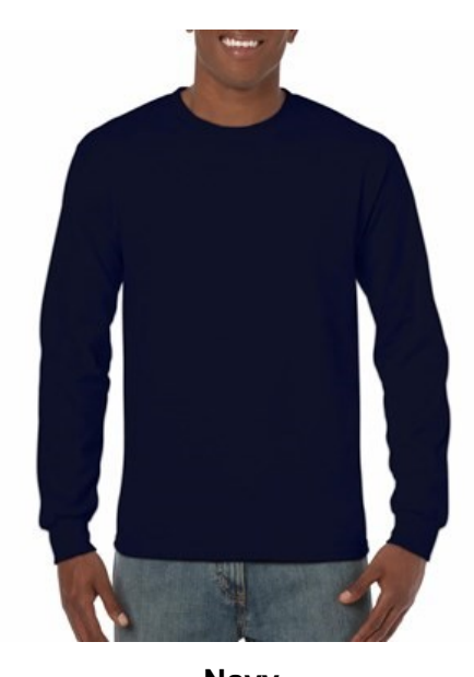
Navy Available sizes: small - 3x