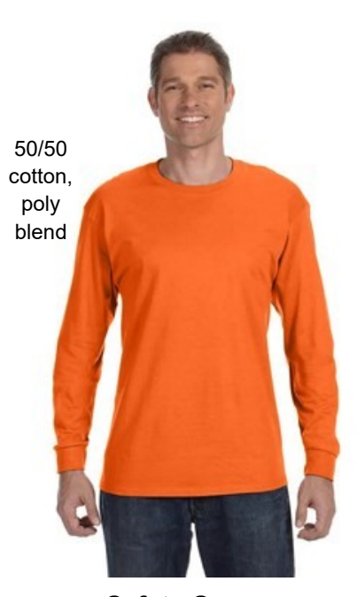
Safety Orange Available sizes small - 3x