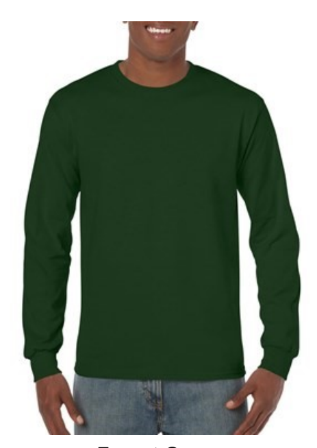
Forest Green Available sizes small - 3x