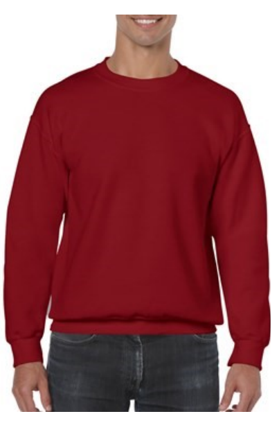
Cardinal Red Available sizes: small - 5x