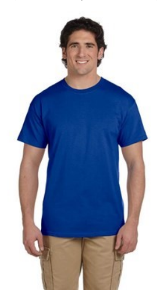
Metro Blue Available sizes: small - 5x