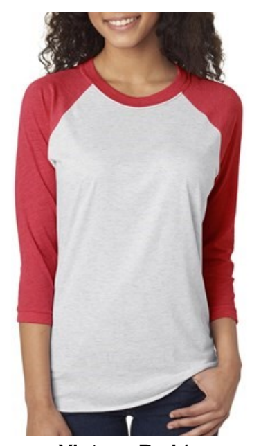
Vintage Red / Heather White Available sizes: xtra small - 3x