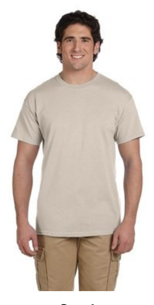
Sand Available sizes: small - 4x (no 5x)