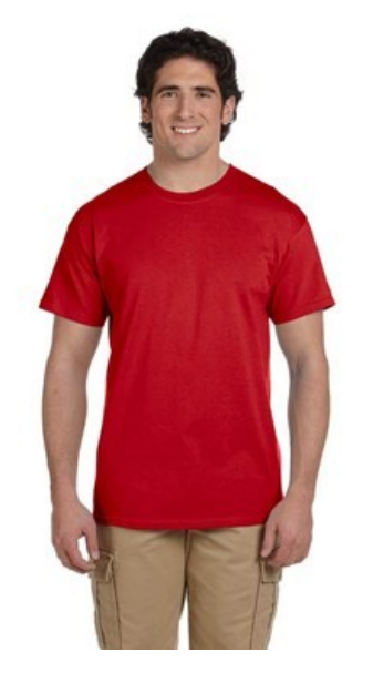
Red (true red) Available sizes: small - 5x