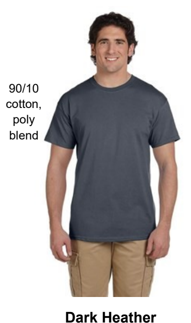
( heathered ) Available sizes: small - 5x