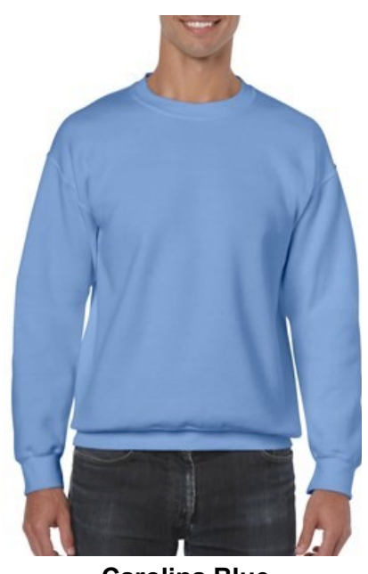
Carolina Blue Available sizes: small - 5x