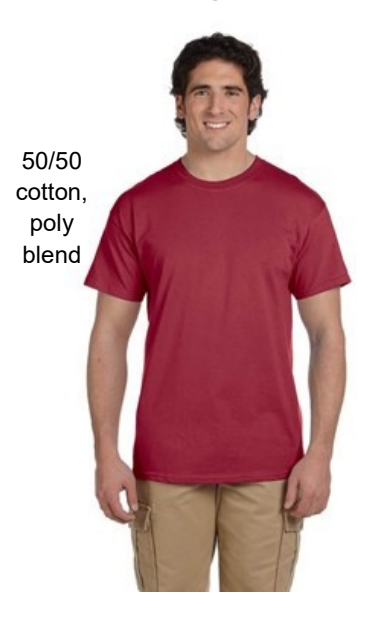
Heathered Cardinal Available sizes small - 5X (3x currently unavailable)