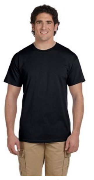
Black Available sizes small - 5x