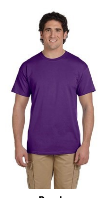
Purple Available sizes: small - 5x