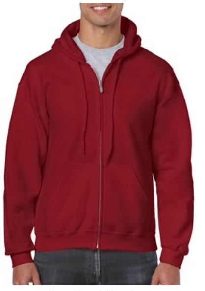
Cardinal Red Available sizes: small - 5x