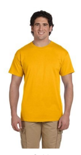
Gold Available in sizes: small - 5x