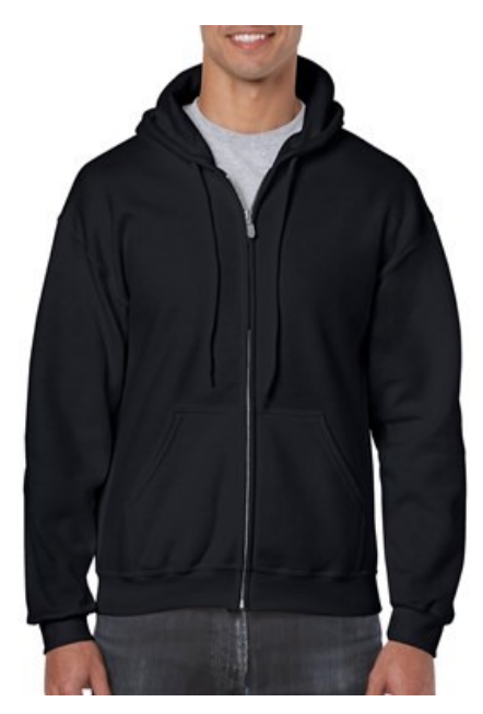
Black Available sizes: small - 5x