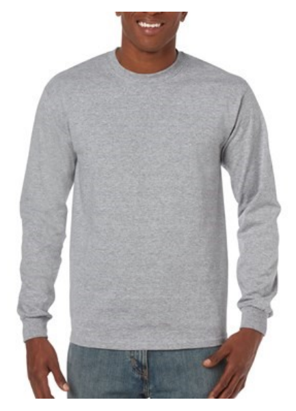
Sport Grey Available sizes: small - 3x