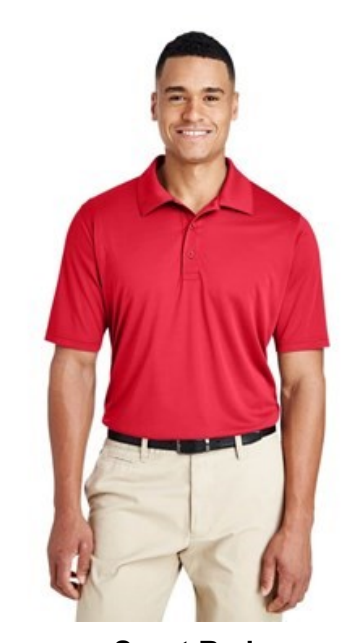
Sport Red Available sizes: xtra small - 6x