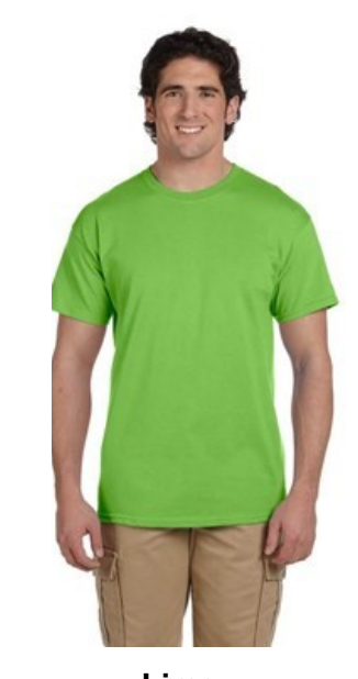
Lime Available sizes small - 5x