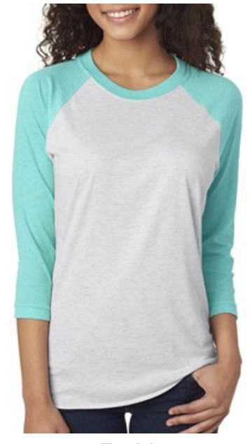
Teal / Heather White Available sizes: xtra small - 3x

Vintage Black Available sizes: xtra small - 3x