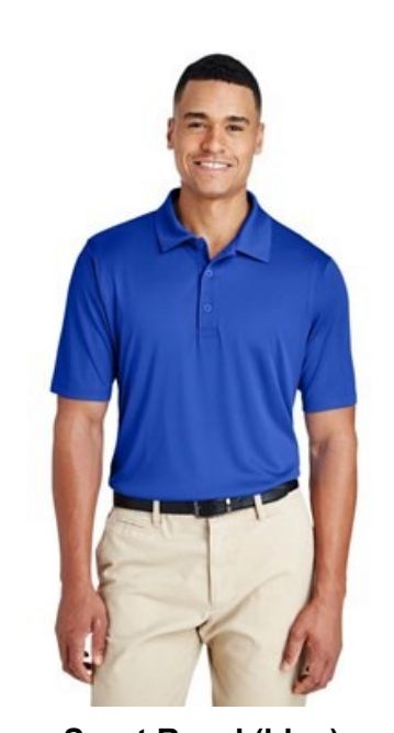
Sport Royal (blue) Available sizes: xtra small - 6x