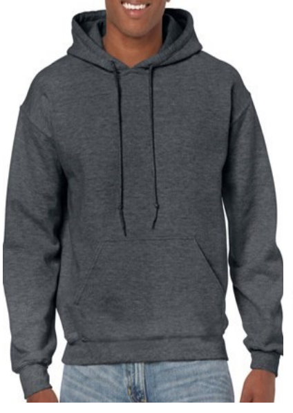
Dark Heather Available sizes: small - 5x