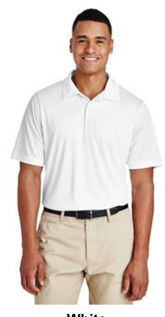
White Available sizes: xtra small - 6x