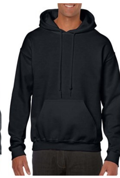
Black Available sizes: small - 5x