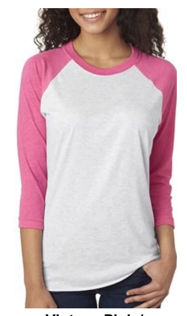
Vintage Pink / Heather White