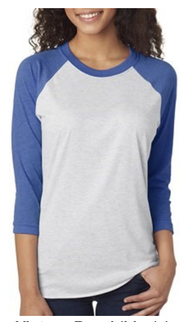
Vintage Royal (blue) / Heather White