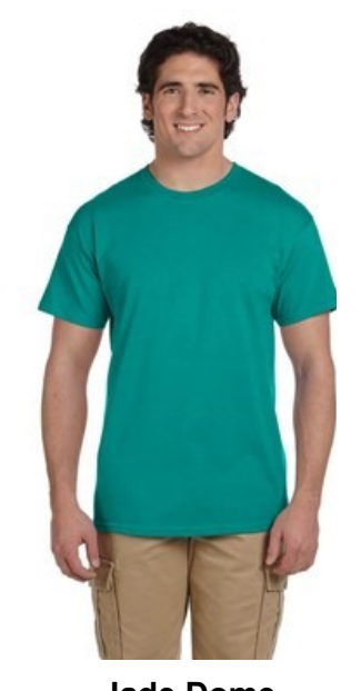
Jade Dome Available sizes: small - 5x