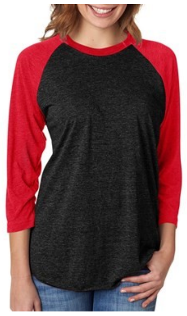
Vintage Red / Vintage Black

Vintage Black Available sizes: xtra small - 3x