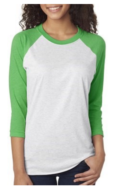
Envy Green / Heather White Available sizes: xtra small - 3x