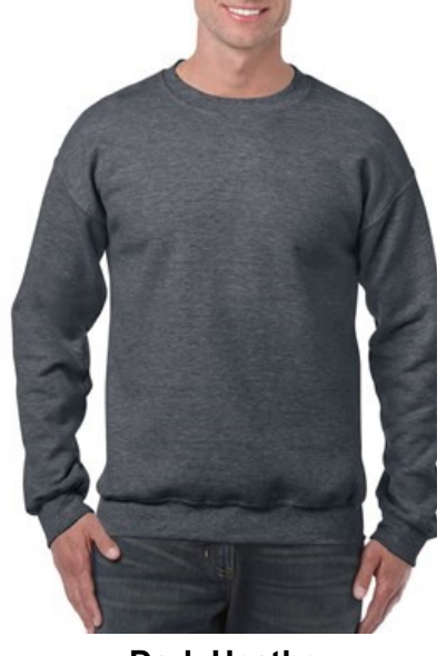
Dark Heather Available sizes: small - 5x