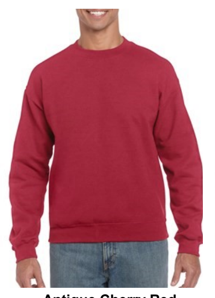
Antique Cherry Red (heathered) Available sizes: small - 5x