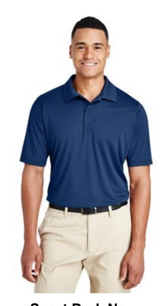
Sport Dark Navy Available sizes: xtra small - 6x