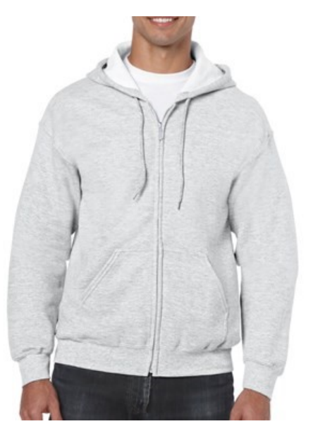
Ash Grey Available sizes: small - 5x