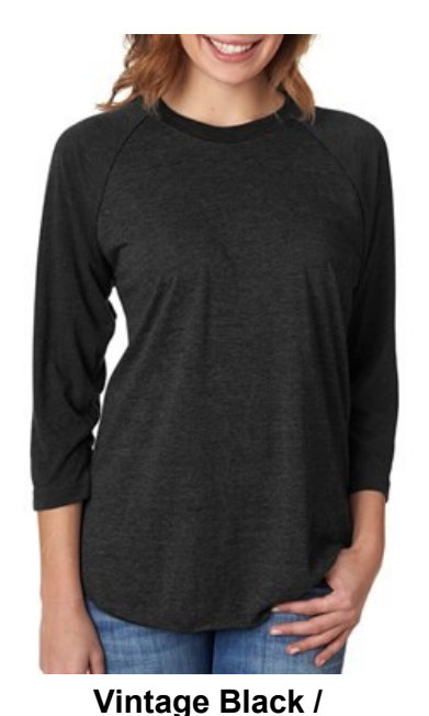
Vintage Black Available sizes: xtra small - 3x