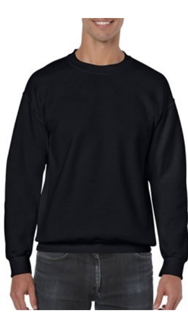
Black Available sizes: Small- 5x