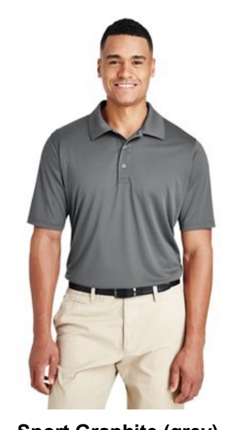
Sport Graphite (grey) Available sizes: xtra small - 6x