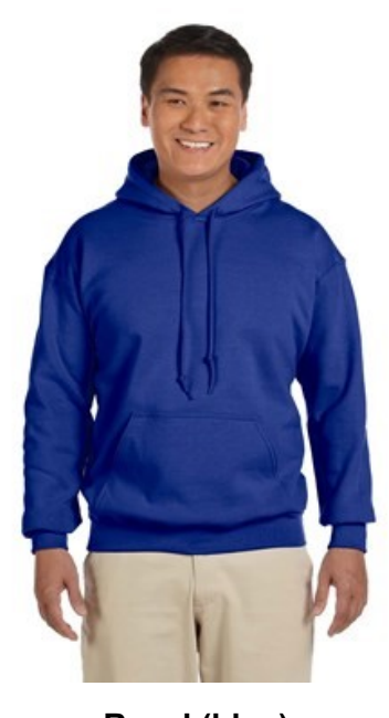
Royal (blue) Available sizes: small - 5x