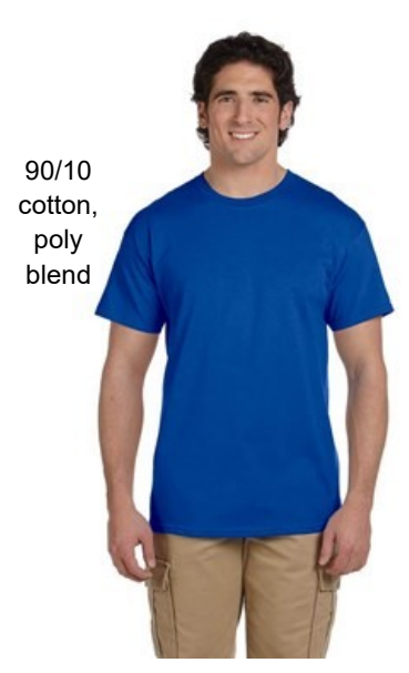
Antique Royal (heathered) Available sizes: small - 5x