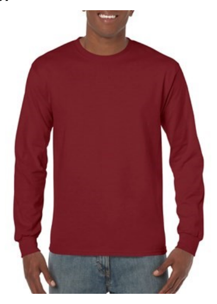
Garnet Available sizes small - 3x