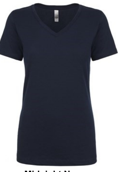
Midnight Navy Available sizes: xtra small - 3x