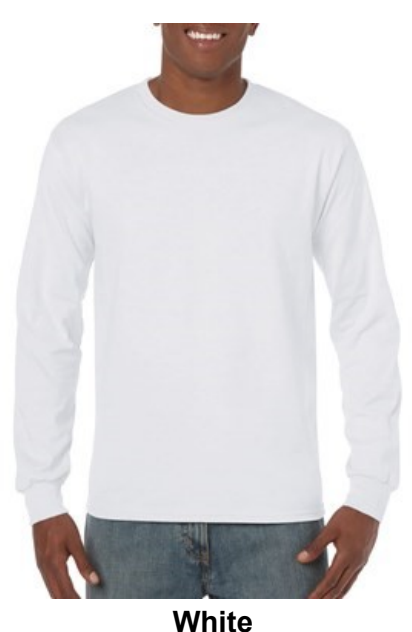
Available sizes: small - 3x