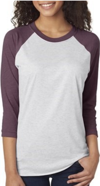
Vintage Purple / Heather White Available sizes: xtra small - 3x