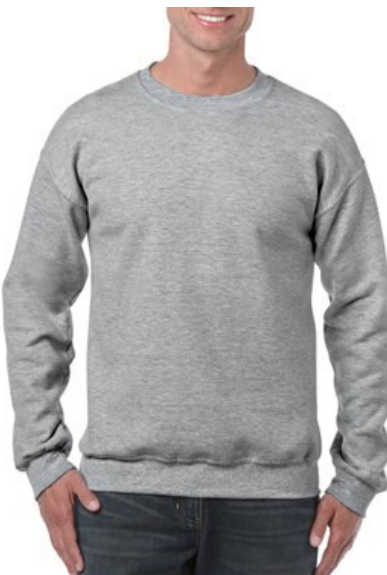
Sport Grey Available sizes: small - 5x