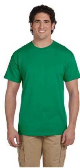
Kelly Green Available sizes s - 3x (4x, 5x unavailable)