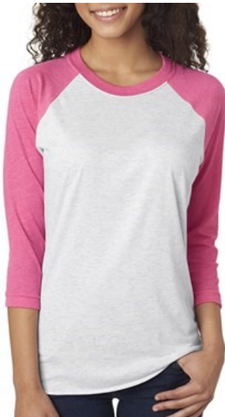
Vintage Pink / Heather White Available sizes: xtra small - 3x