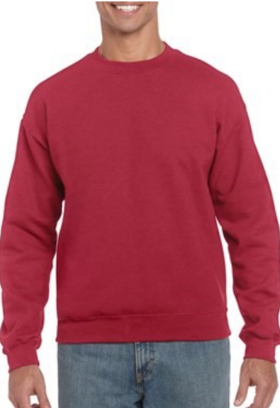
Antique Cherry Red (heathered) Available sizes: small - 5x