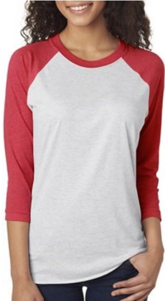
Vintage Red / Heather White Available sizes: xtra small - 3x