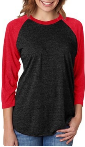
Vintage Red / Vintage Black Available sizes: xtra small - 3x