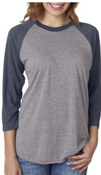
Vintage Navy / Heather Grey