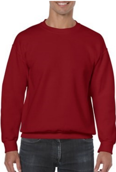
Cardinal Red Available sizes: small - 5x