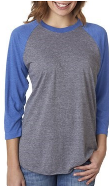
Vintage Royal (blue) / Heather Grey