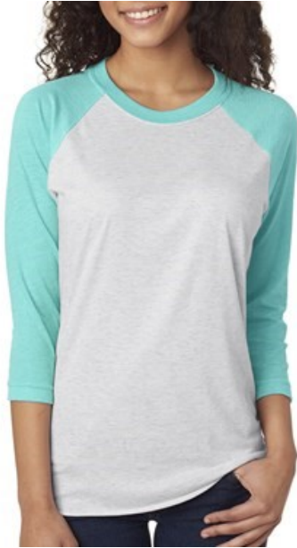
Teal / Heather White Available sizes: xtra small - 3x