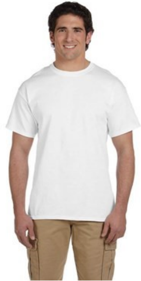
White Available sizes: small - 5x