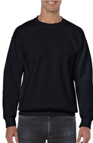
Black Available sizes: Small- 5x