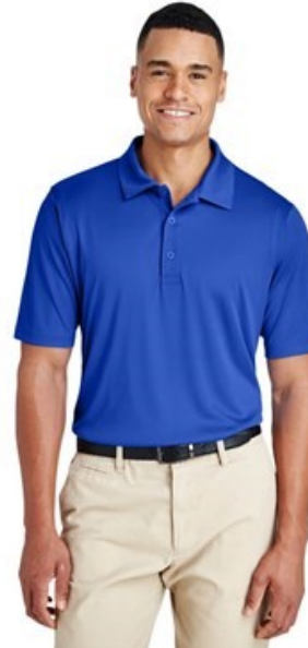
Sport Royal (blue)