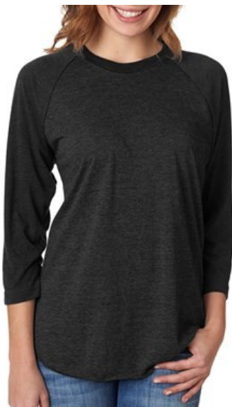
Vintage Black / Vintage Black