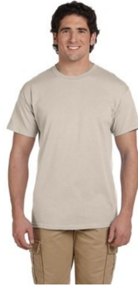
Sand Available sizes: small - 4x (no 5x)