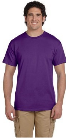
Purple Available sizes: small - 5x