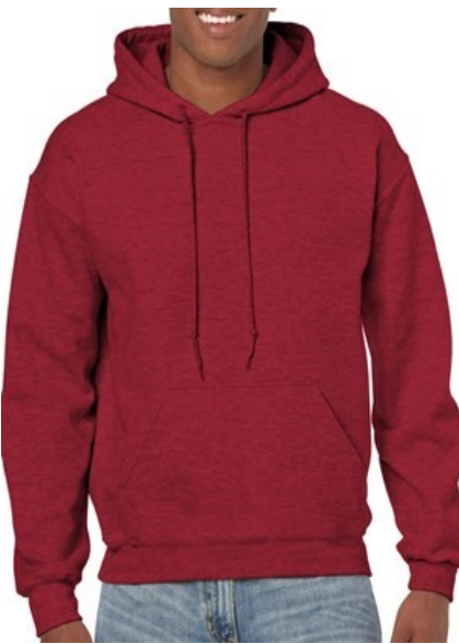
Antique Cherry Red (heathered)