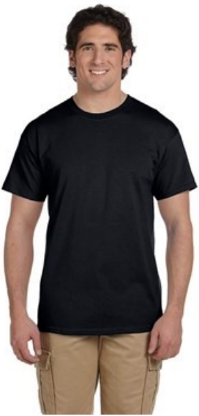
Black Available sizes small - 5x