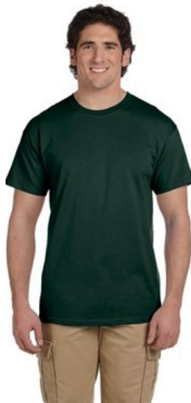
Forest Green Available sizes small - 5X