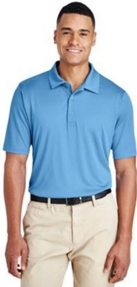
Sport Light Blue