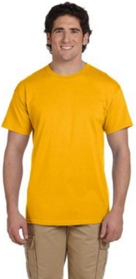
Gold Available in sizes: small - 5x