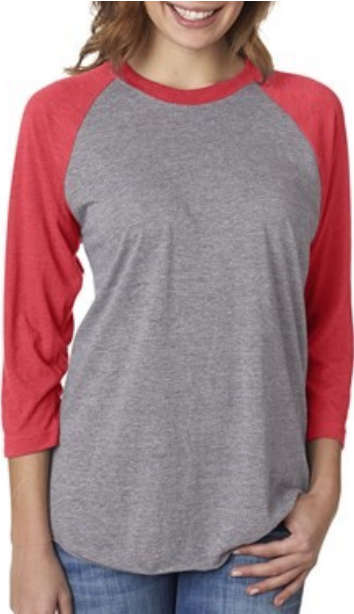
Vintage Red / Heather Grey Available sizes: xtra small - 3x