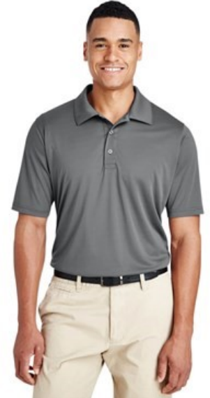
Sport Graphite (grey)