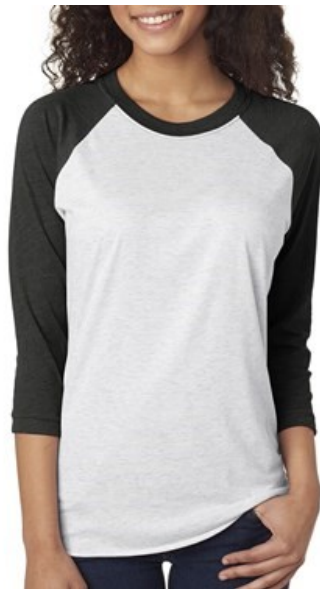
Vintage Black/ Heather White