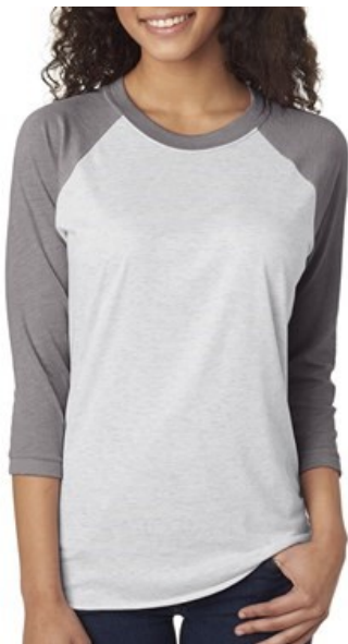
Heather Grey / Heather White