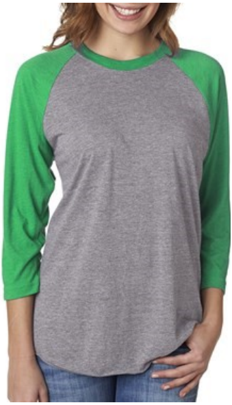
Envy Green / Heather Grey Available sizes: xtra small - 3x