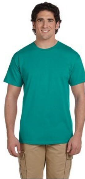
Jade Dome Available sizes: small - 5x