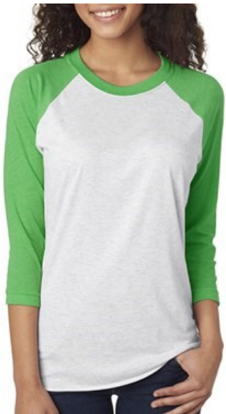
Envy Green / Heather White Available sizes: xtra small - 3x