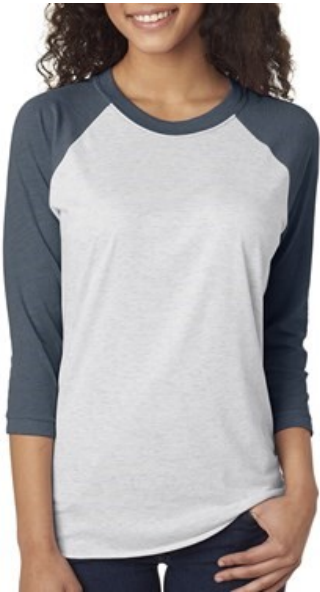
Indigo / Heather White Available sizes: xtra small - 3x