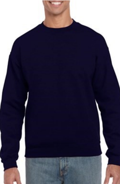
Navy Blue Available sizes: Small- 5x