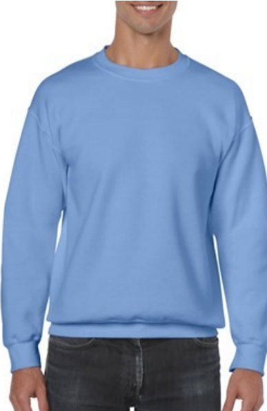
Carolina Blue Available sizes: small - 5x