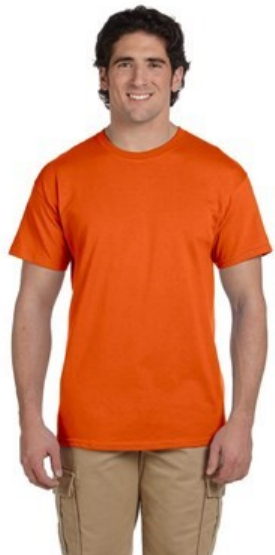
Orange Available sizes: small - 4x (no 5x)