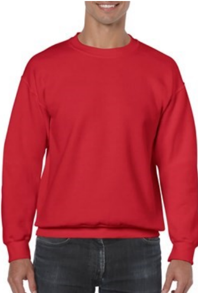
Red Available sizes: small - 5x