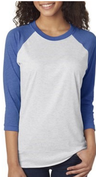
Vintage Royal (blue) / Heather White