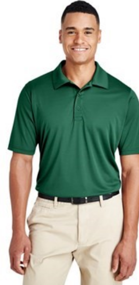
Sport Forest Green