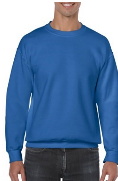
Royal (blue) Available sizes: Small- 5x