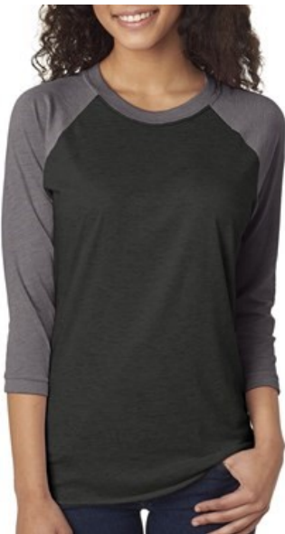
Heather Grey / Vintage Black