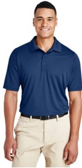
Sport Dark Navy