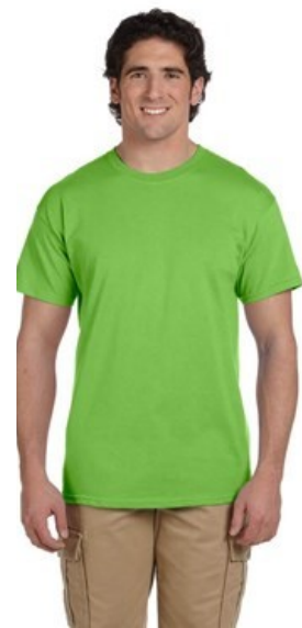
Lime Available sizes small - 5x