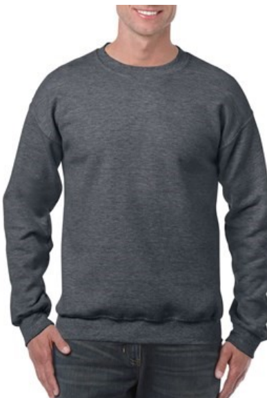
Dark Heather Available sizes: small - 5x