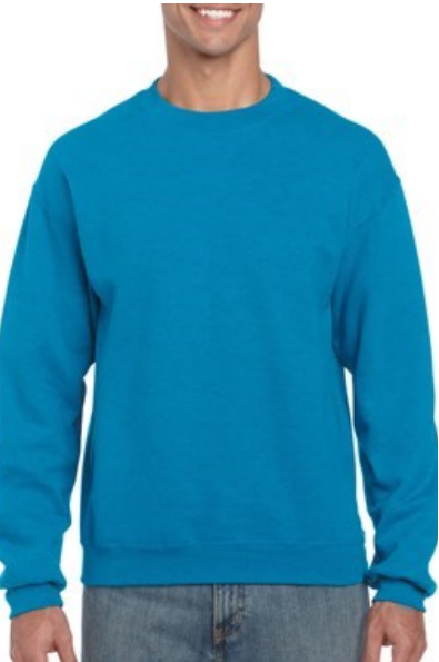
Antique Sapphire (heathered) Available sizes: Med - 5x