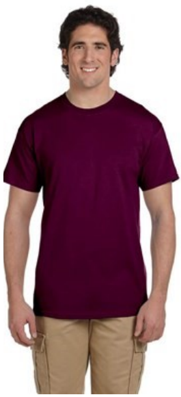
Maroon Available sizes small - 5x